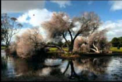
Nancy Wilkinson Flooded Paperbarks

I am a student at Perth Central TAFE studying for my Diploma in Photoimaging. It doesn't matter whether photographic assignments require scientific or artistic approaches, the success of the photograph is determined by correct lighting. It's all about the light! It sets the tone, determines the outcome.....the rest is in the eye of the beholder.