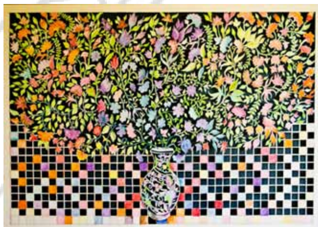
Still Life , Cut paper