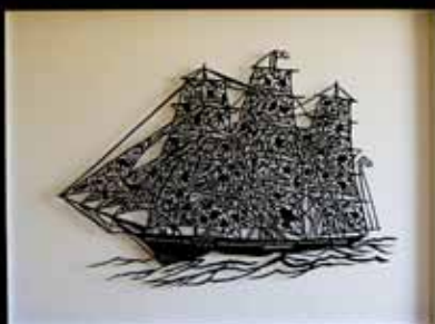
Ship , Cut paper