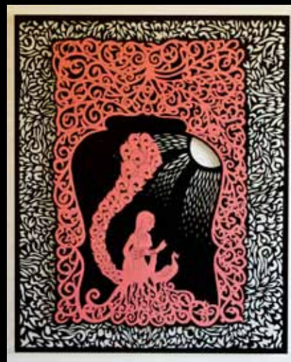
Moonlight, Cut paper