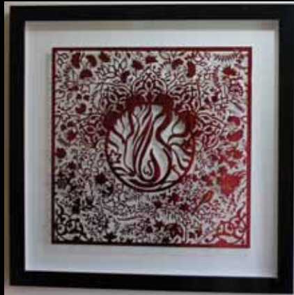
Allah, Cut paper

I like to express idea that negative spaces are infused with meanings that are as important as positive space. Doing works in cut paper is one way I speak to this. The process is subtractive and so I have to think a few steps ahead. Even with planning, what comes out when I cut away the background is a delightful surprise. The simplicity, flexibility and strength of paper enables me to transform this material into two and three dimensional art forms with a range of expression that is limitless. Thus the craft of building and forming merges with the expression of ideas.