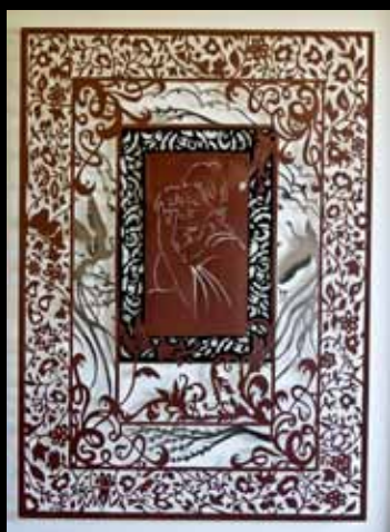
Gaia , Cut paper